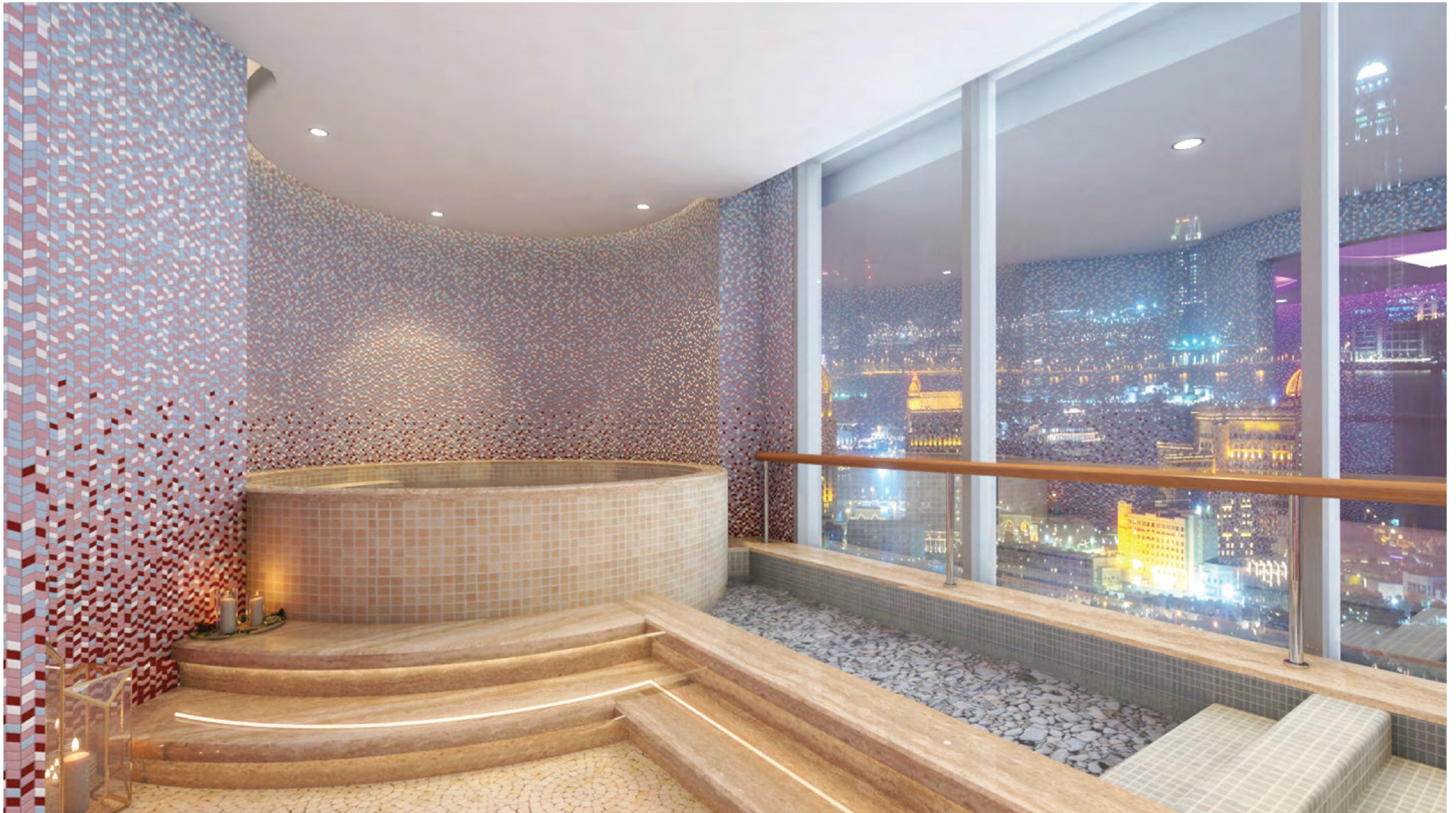
evian® SPA Doha 's Kneipp foot massage area.